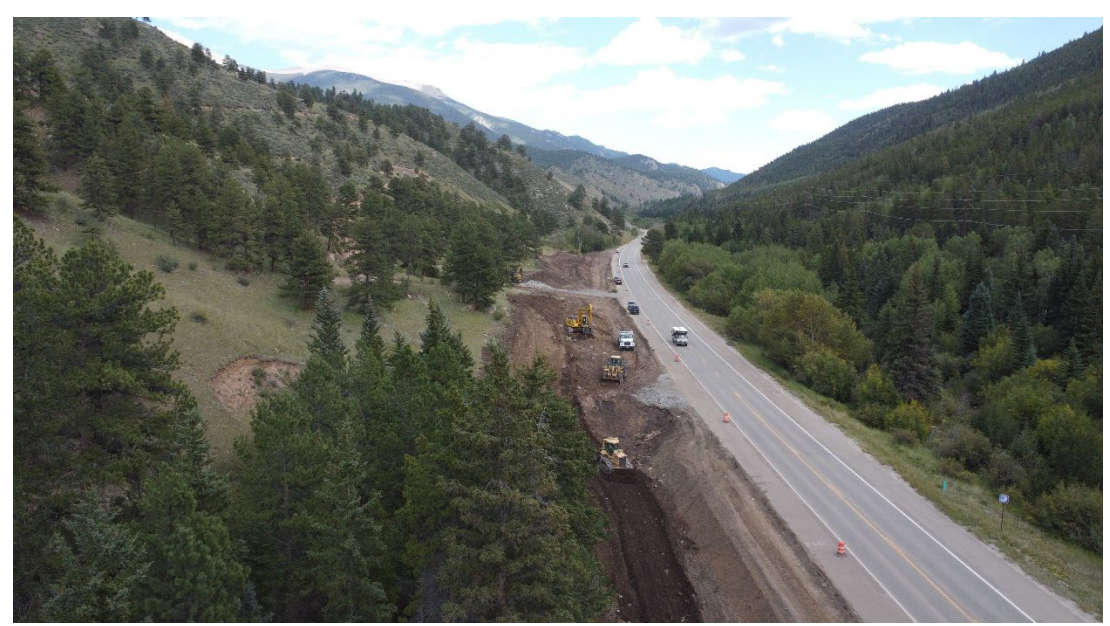
Grading and excavation on the west side of CO 285 near Grant.